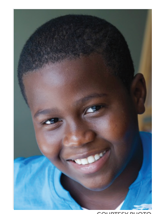
Love Québec, Canada

But one Sunday morning, when I arrived in Sunday School, the problem came back again. I told my teacher that I could not help her put the hymn numbers on the wall because I did not feel well. Then I had to go to the restroom. The teacher